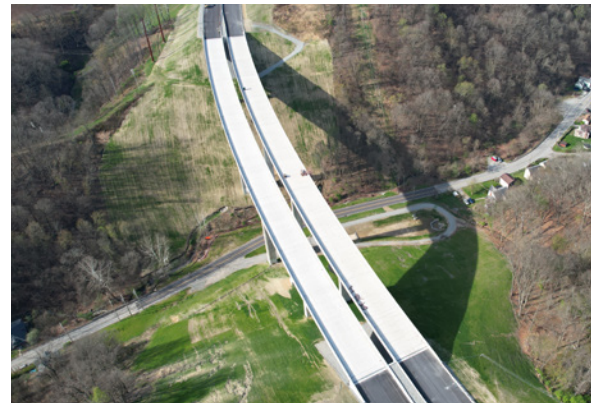
Bridges over Coal Valley Road.