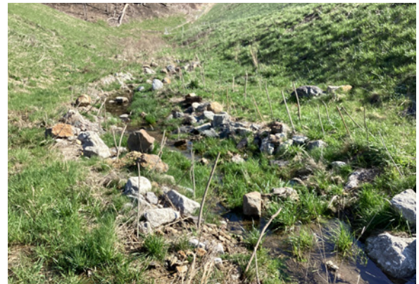
Stream relocation - live stake plantings.