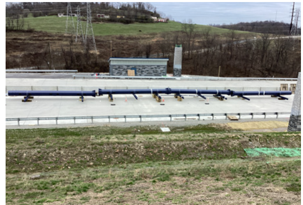
Over the road tolling facility.