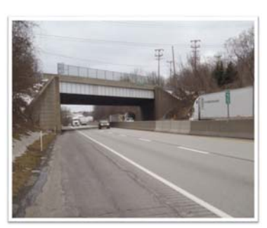
Center Road Bridge Replacement in Monroeville