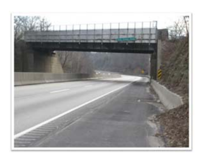
Unity Trestle Road Bridge Replacement in Plum Borough