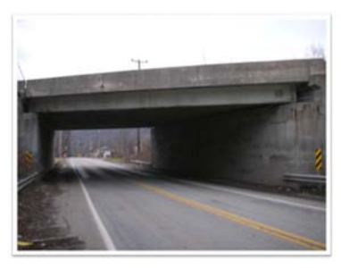
Lowering of Hulton Road SR 2058 in Plum Borough