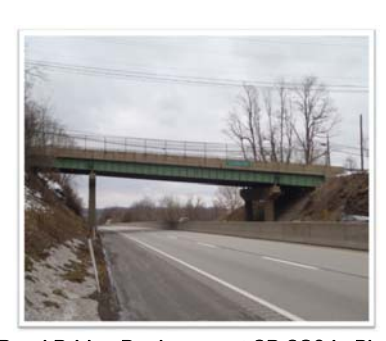
Saltsburg Road Bridge Replacement SR 380 in Plum Borough