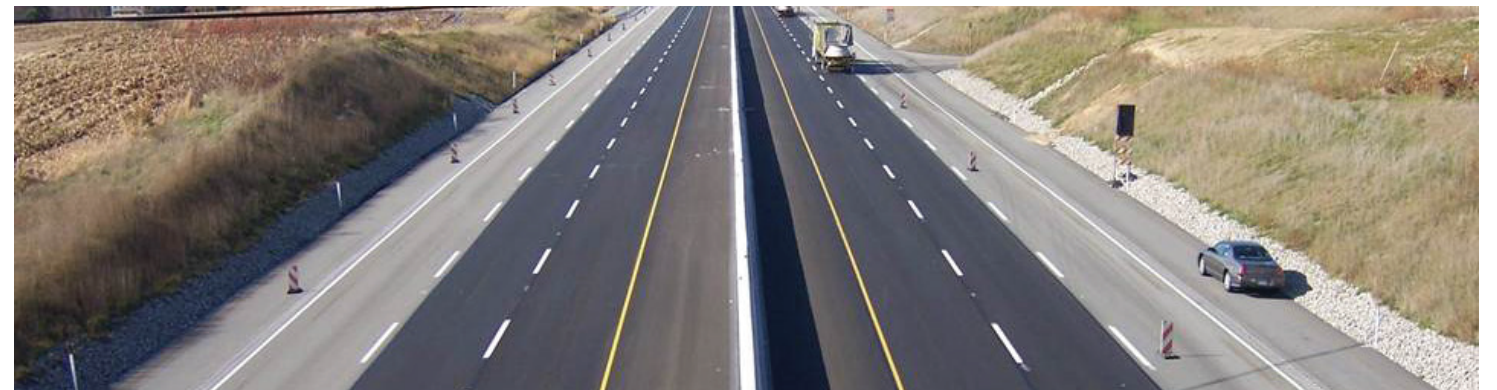
← Typical Total Reconstruction Section 122' out-to-out →

The materials presented this evening will be posted on the PTC's website.