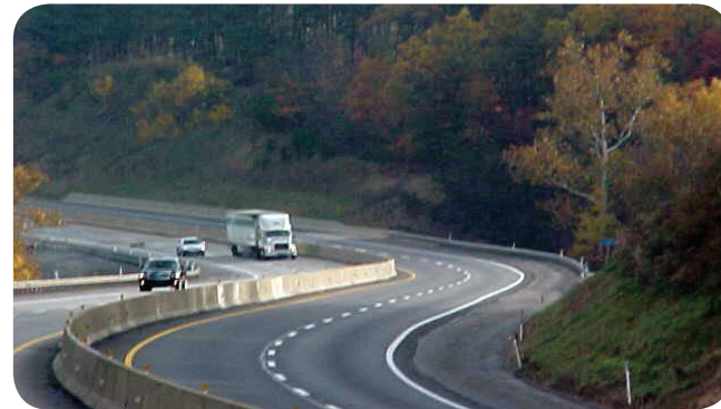
Westbound looking east at Milepost 180

Upon completion of this project, the existing four-lane facility with 12-foot shoulders and a 10-foot median will be upgraded to a six-lane facility (three 12-foot travel lanes eastbound and three 12 foot travel lanes westbound) with a 26-foot median and 12-foot outside shoulders. The new 26-foot median will consist of two 12-foot wide inside shoulders with a two-foot wide concrete barrier in its center. These highway design upgrades will result in substantial improvements to safety and complete replacement of the existing pavement from the ground up. The existing pavement consists of many bituminous overlays over the original 75 year-old concrete pavement.