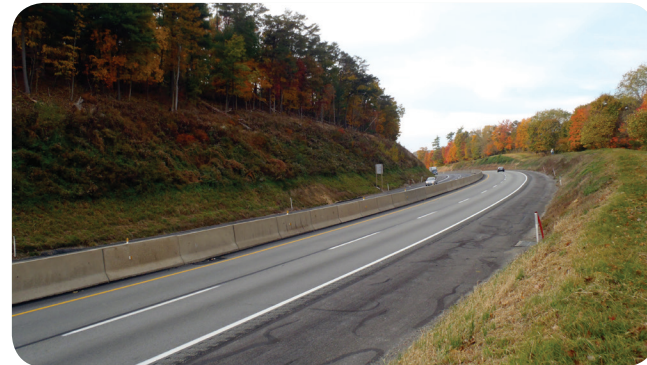
Westbound looking west at Milepost 180.2