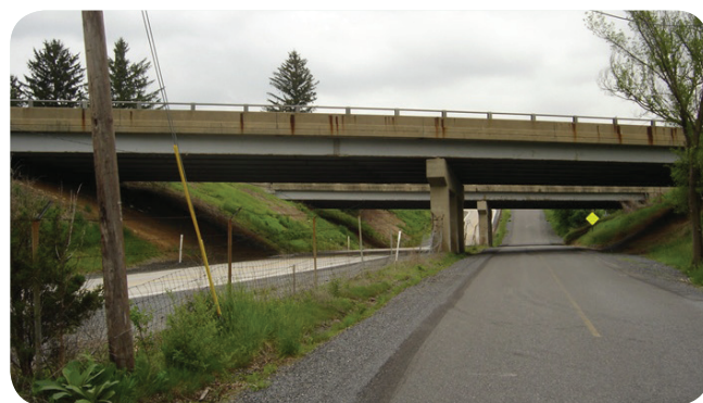
Bridge B-562 for I-76W over T-300 (Locke Road) and Service Road looking south, Milepost 185.89.

For additional project information, please visit the project website at: