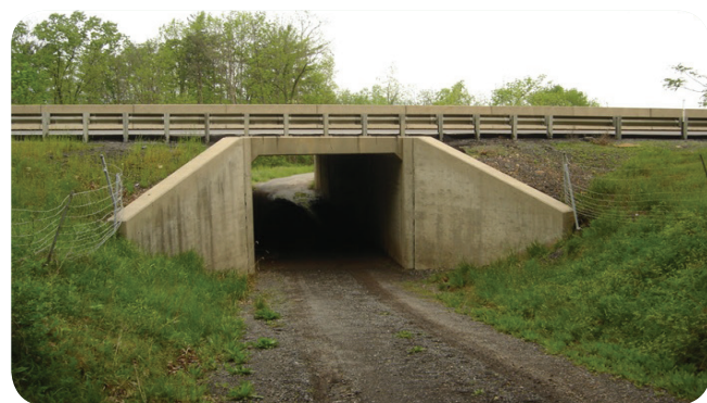
Culvert B-434 over Cemetery Road looking north, Milepost 183.46.