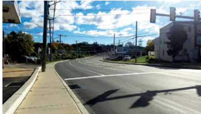
Photo of the completed Phase 2 construction looking east on Ridge Pike at the new Conshohocken Road intersection.