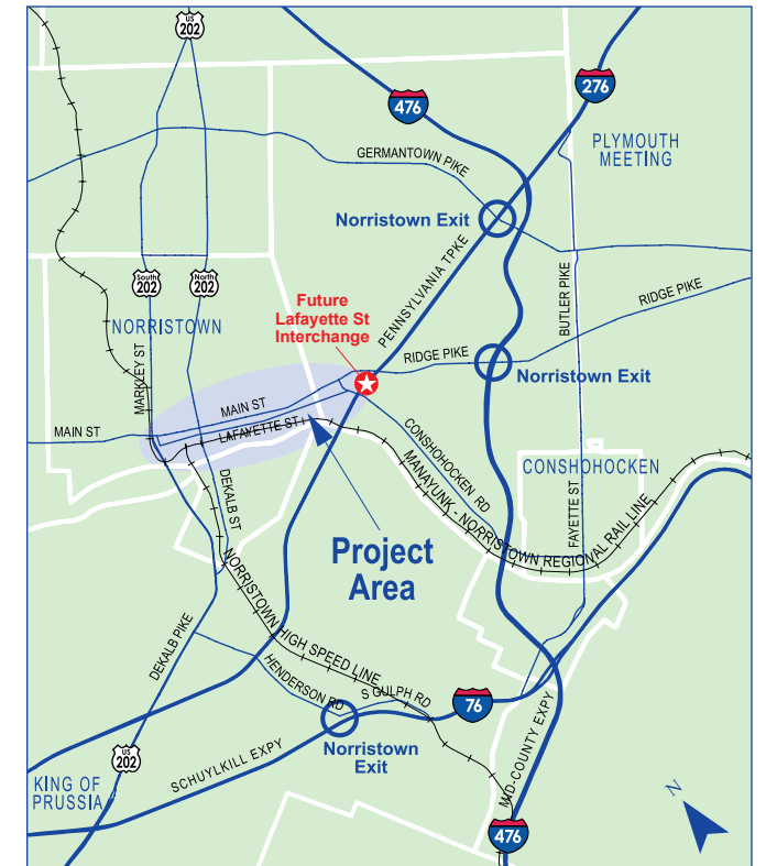
The Lafayette Street Extension Project area serves Norristown's Main Street and Plymouth Township's Ridge Pike and Conshohocken Road as well as the Schuylkill River waterfront redevelopment area. It is at the core of a significant regional highway and transit system.