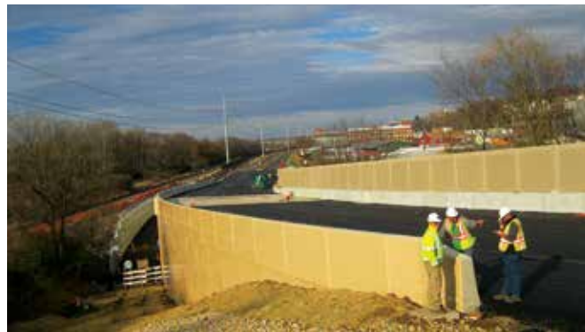
Photo of the completed Phase 1 construction looking toward Norristown showing the bridge over Ross Street and the Schuylkill River Trail between the new Lafayette Street and the Norfolk Southern Railroad bridge.