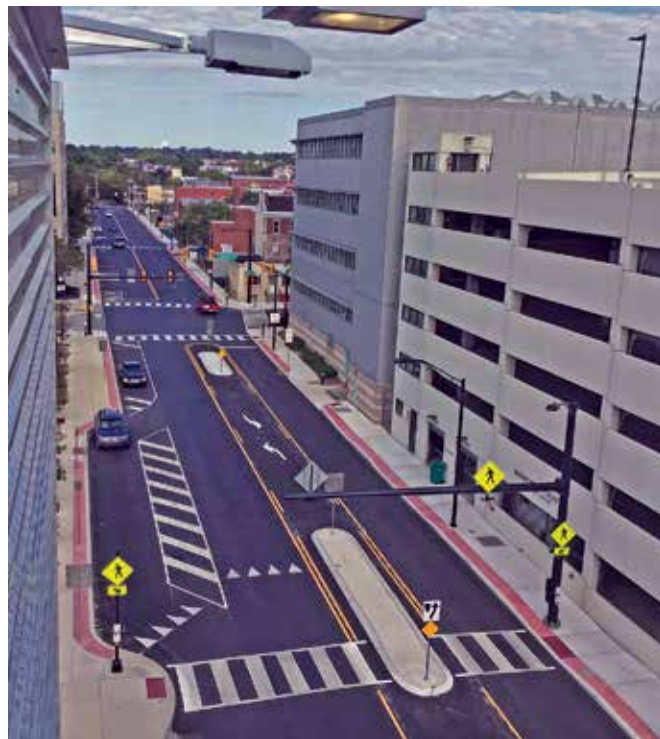
Phase 3 rebuilt Lafayette Street in front of the SEPTA Norristown Transportation Center. Improvements included safer pedestrian connections from transit to the county courthouse complex. The Phase 5 connection to the Dannehower Bridge will be built in the distance.