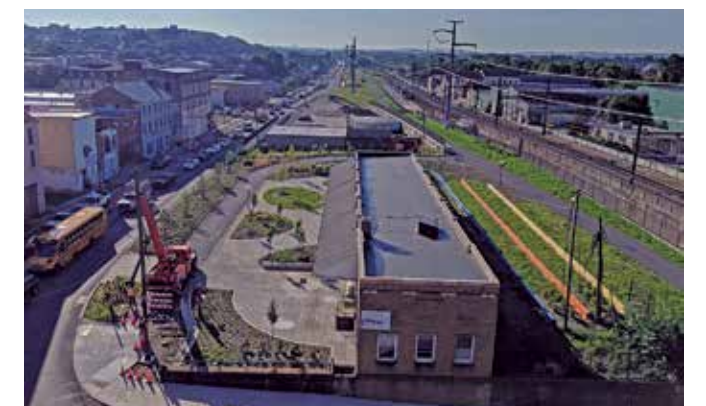
Phase 3 construction is complete. In this photo looking east from DeKalb Street, the railroad viaduct is gone, the Schuylkill River Trail is relocated, the Freight Station property is being improved, and Lafayette Street has been widened and extended.