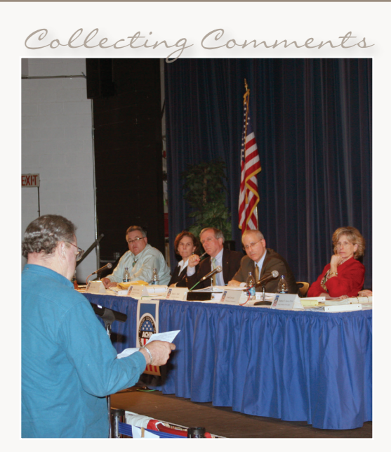
A panel of ACHP members listen to comments during a public meeting.

Whether or not the ACHP becomes involved in consultation, you may contact the ACHP to express your views or to request guidance, advice, or technical assistance. Regardless of the